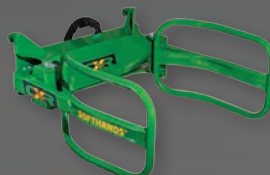
CXR SOFTHANDS FARMER