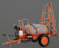
COLUMBIA TRAILED 2000