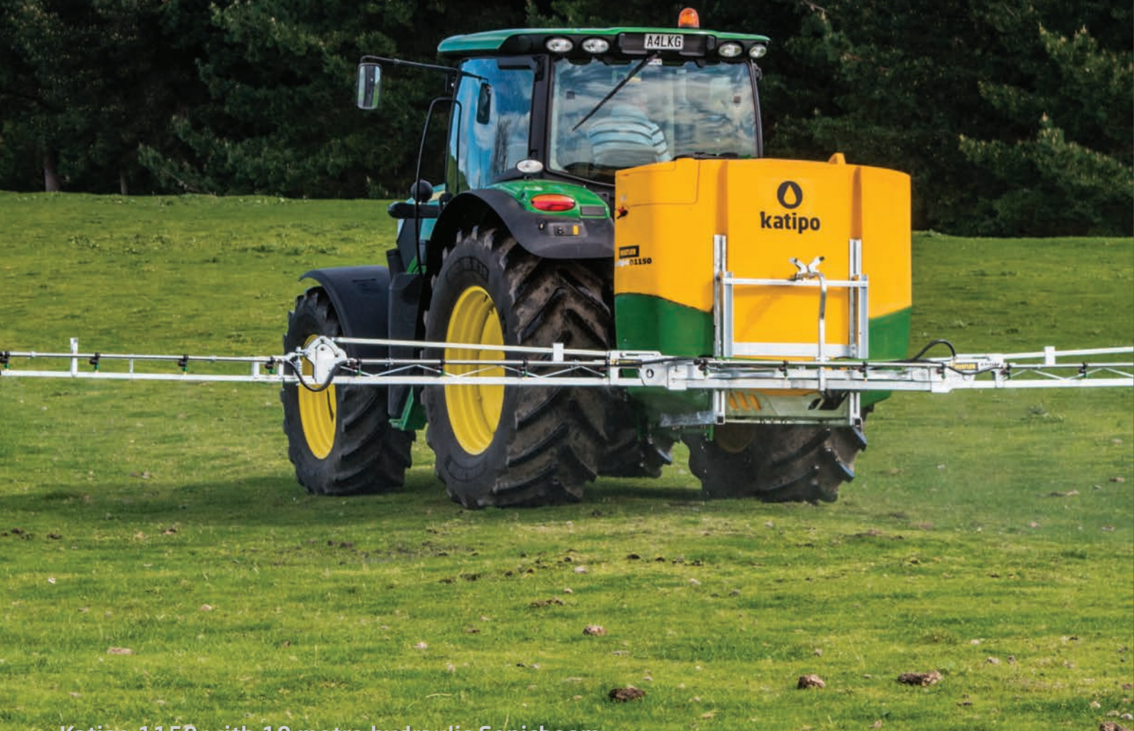
Katipo 1150 with 10 metre hydraulic Sonicboom.

Once bitten you'll be smitten! With farming at our core, and a love for machines our passion - the rethinking of our already successful sprayer range was pure instinct. The revolutionary Katipo for farmers and contractors embodies a raft of new features never seen in agricultural sprayers before - all designed to make your life easier.