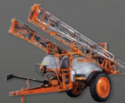
ADVANCE TRAILED 3000