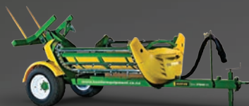
SL700X TRAILED 2-BALE FEEDER