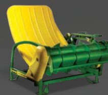
CHAINLESS 2000 LINKAGE FEEDER