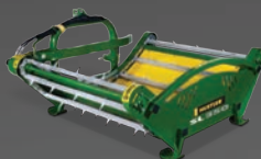
SL350 LINKAGE FEEDER