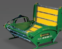
SL450X LINKAGE TROUGH FEEDER