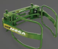
MEGA SOFTHANDS CONTRACTOR