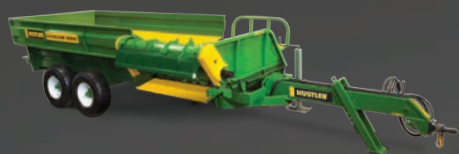
CHAINLESS 8000 TRAILED 4-BALE FEEDER