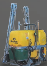
FOX LINKAGE 1200-2000