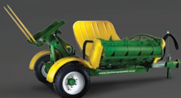
CHAINLESS 4000 TRAILED 2-BALE FEEDER