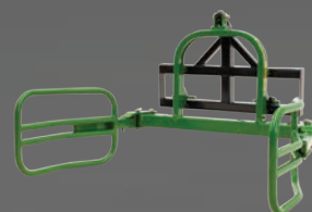
SYSTEM 10 SOFTHANDS FARMER