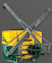
KATIPO LINKAGE 680-1150