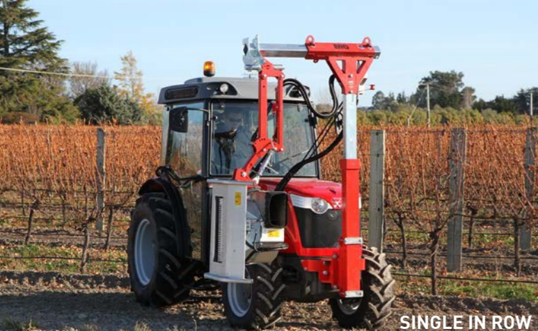
SINGLE IN ROW