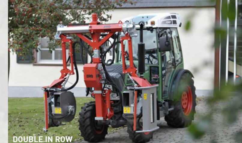
DOUBLE IN ROW