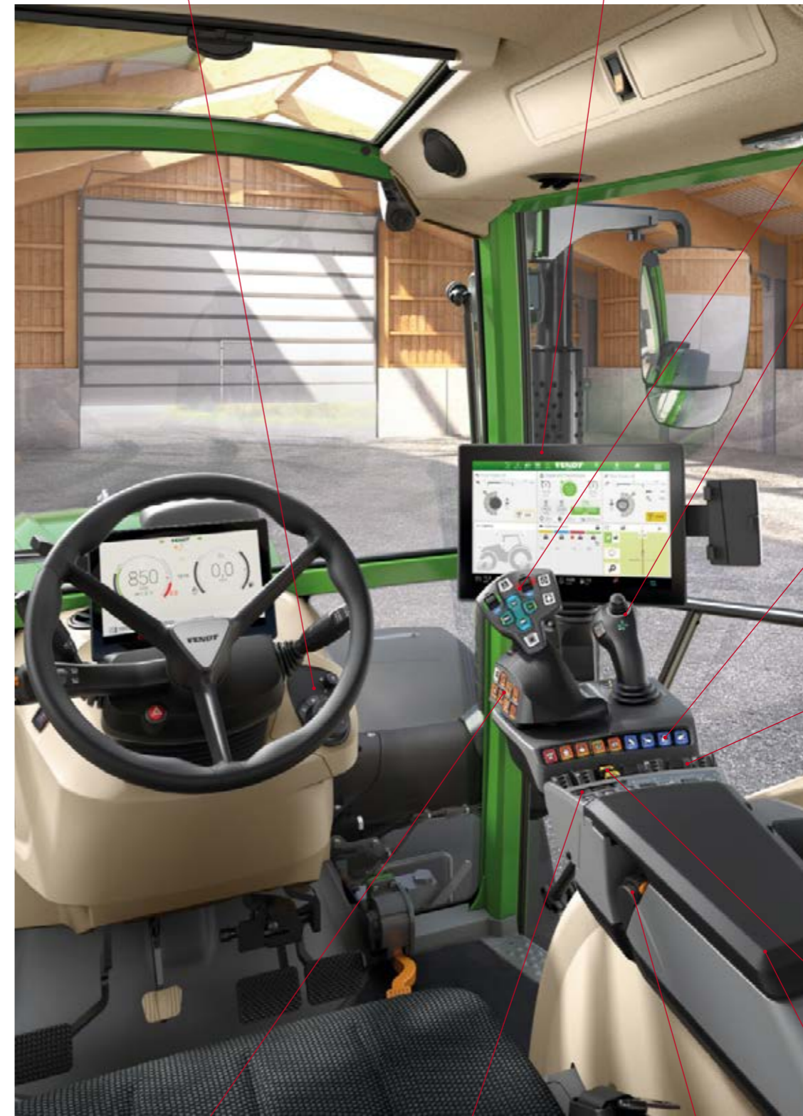
As well as the familiar clover leaf operation, the new multifunction joystick includes two controls for proportional valve control as well as four freely assignable white keypads.